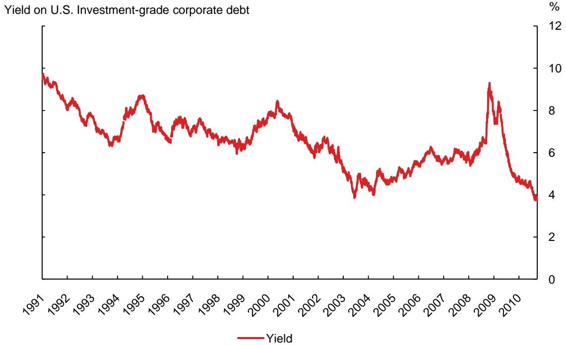
Chart 2: Corporate all-in yields at historic lows