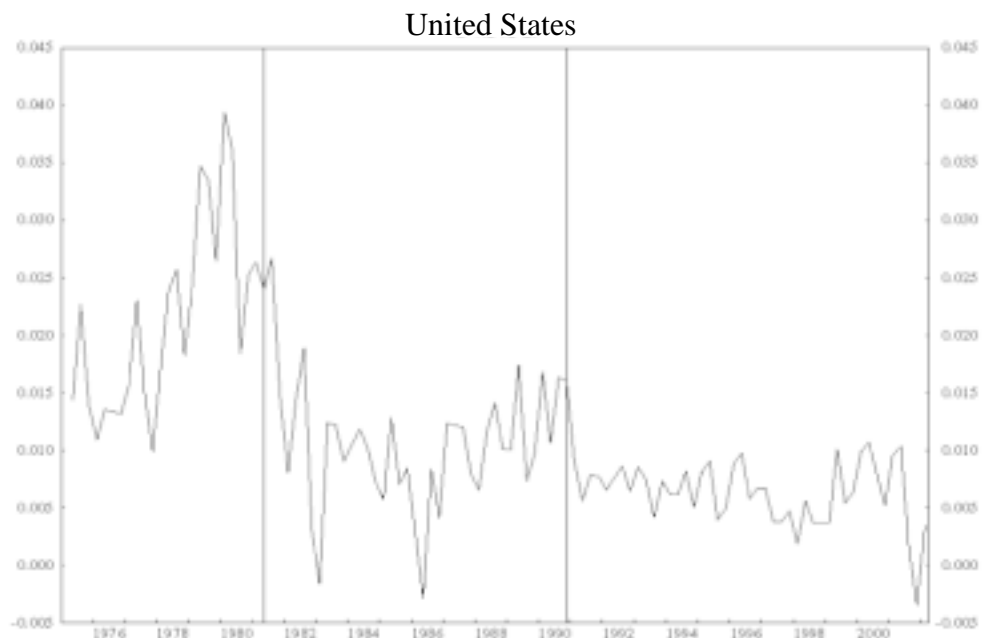
Figure C1 (cont.) Identified Structural Breaks in the CPI Inflation Series, by Country