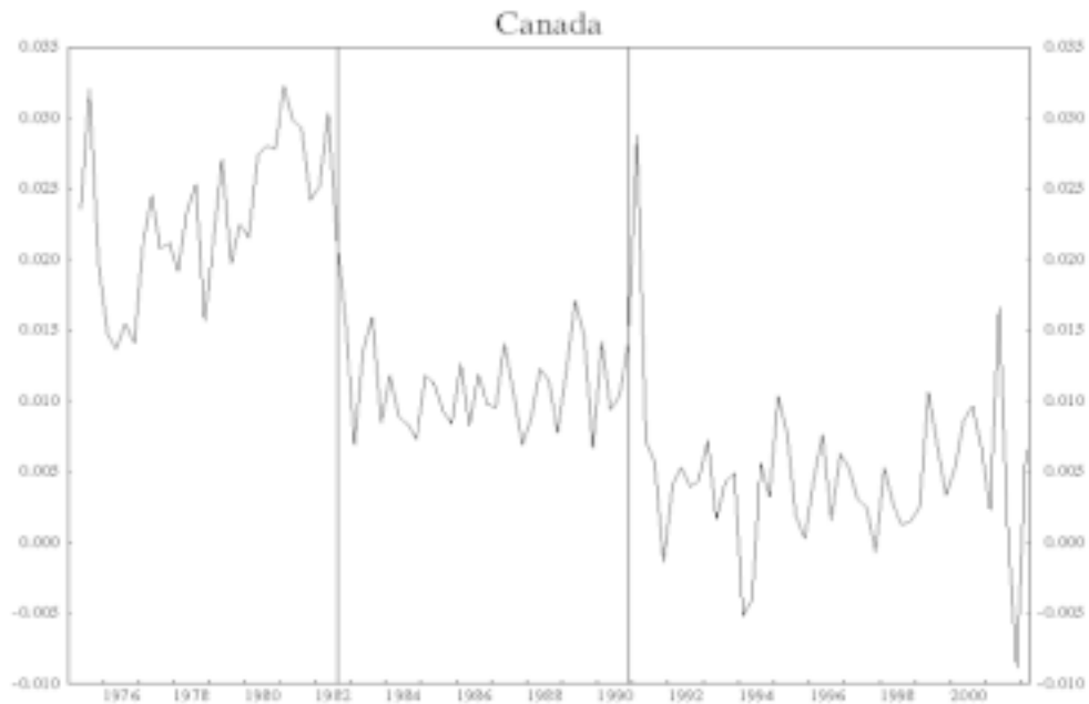
Figure C1 (cont.) Identified Structural Breaks in the CPI Inflation Series, by Country