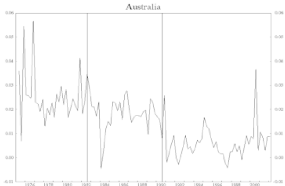
Figure C1: Identified Structural Breaks in the CPI Inflation Series, by Country