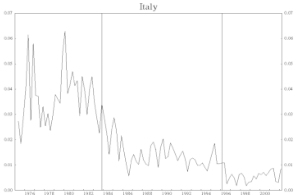
Figure C1 (cont.) Identified Structural Breaks in the CPI Inflation Series, by Country