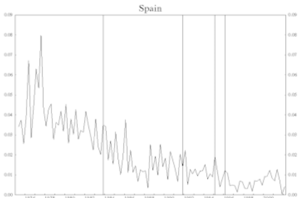
Figure C1 (cont.) Identified Structural Breaks in the CPI Inflation Series, by Country