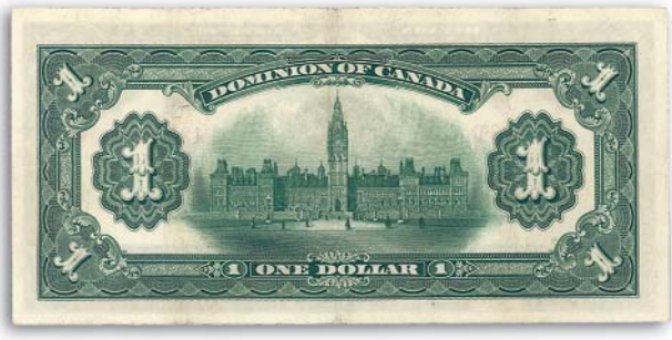
Dominion of Canada, $1, 1917

This note features Princess Patricia, daughter of the Duke and Duchess of Connaught and patron of the famous Princess Patricia's Canadian Light Infantry.