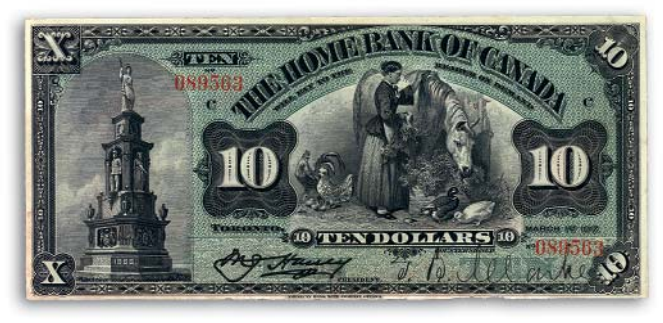
Home Bank, $10, 1917

The Home Bank was one of several chartered banks established in Canada during a period of economic expansion early in the twentieth century. Its operations were suspended in 1923, owing to poor management. Following a Royal Commission into its operations, the Office of the Inspector General of Banks (the forerunner of the Office of the Superintendent of Financial Institutions) was established in 1925.