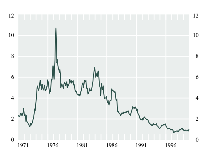
Chart 3 Standard Deviation of CPI Inflation in 20 Countries

* Canada, United States, Japan, Australia, New Zealand, Austria, Belgium, Denmark, Finland, France, Germany, Ireland, Italy, Netherlands, Norway, Spain, Switzerland, United Kingdom, Portugal, and Sweden